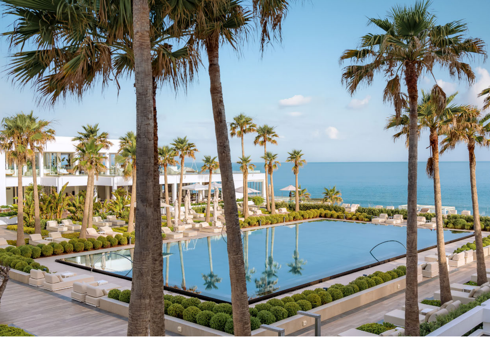
A FANTASY OF WATERFRONT LIFE